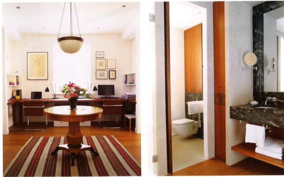
Top: to the right of the Poliform bed, covered with a Kate Bleo blanket, is a cupboard just for handbags. Above left: another Beistemeier table sits in the shared study. The large drawing to the left of the window is by one of Barbara's design heroes, Eileen Gray. Above right: Gareth Davies sourced all the stone and marble in the house, while Arden Hodges lit all the oak floors. 'Aeroplane lights', for nocturnal visits, surround the mirrors. Opposite: in Alan's dressing-room area, an elsewhere, storage in bespoke - it includes drawers for cufflinks and a cubby-hole for the contents of emptied pockets