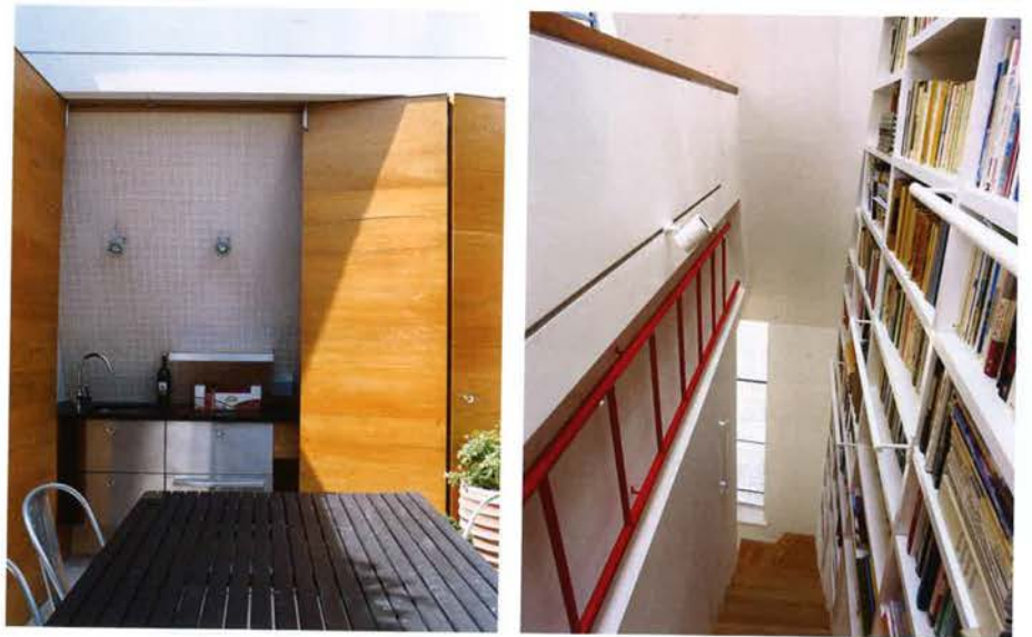
Top: the extra storey allowed space for an enclosed roof terrace, planted by Sammy from Hardy and Perennial, where lavender, wisteria and roses frame an oblong of sky. Sliding doors open onto this private sun-trap from the top-floor music room, and another door opposite leads into a balcony study, which overlooks the living room. Above left: lining the staircase wall are some of a boxed set of lithographs by Josef Albers that Alan bought after they failed to sell at auction. Above right: from the top-floor landing, one can see the bronze rail of the staircase twisting down past four floors